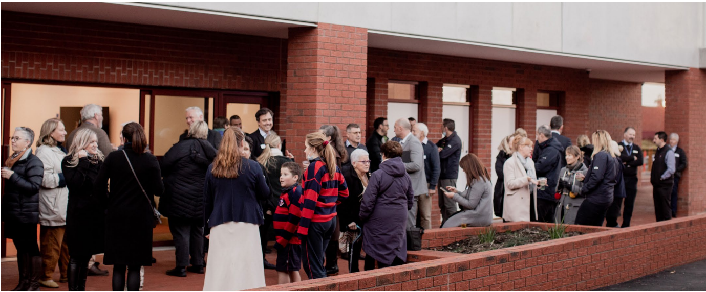
The Friends' community enjoying our inaugural Community Appreciation Day event in May, 2022